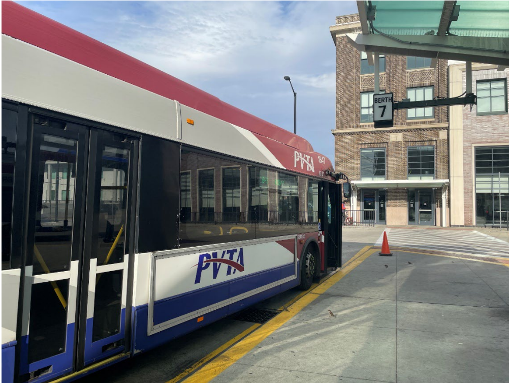
A Pioneer Valley Transit Authority bus parked outside of Springfield Union Station, November 2024