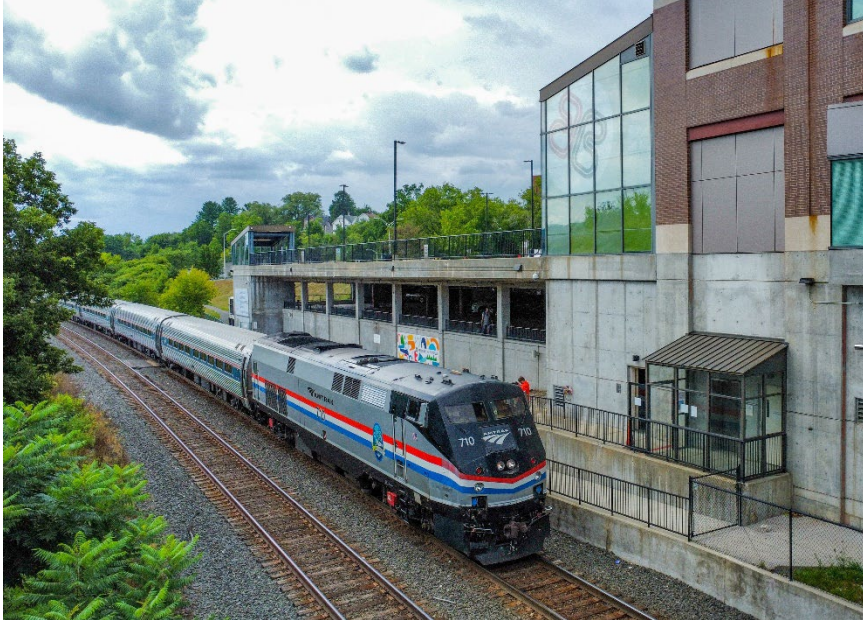
Berkshire Flyer at Pittsfield Station