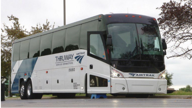
An Amtrak thruway bus