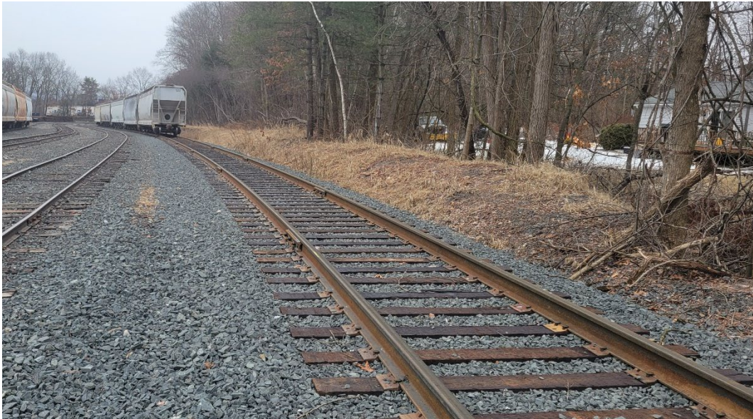
2023 IRAP project Pioneer Valley Railroad, Easthampton Yard Track