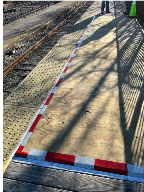
Temporary platform repairs