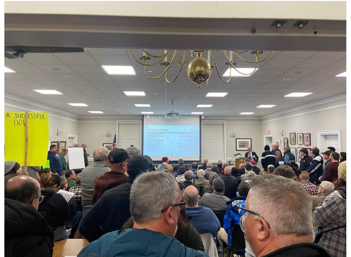
Public meeting at Palmer Public Library on 12/16/24