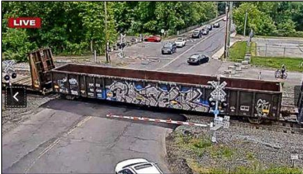
A freight train crosses Front Street in West Springfield