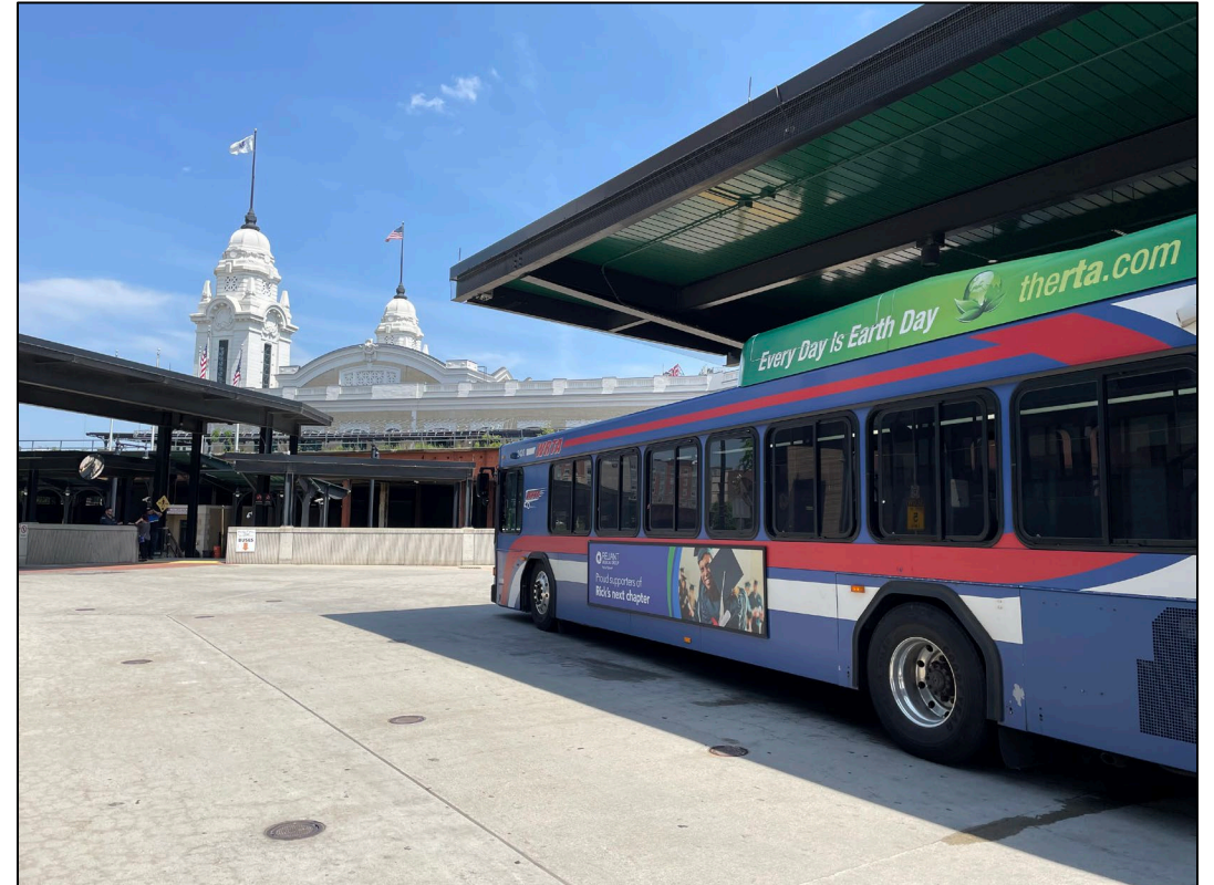
Worcester Regional Transit Authority Transit Hub with Worcester Union Station in distance. May 2024