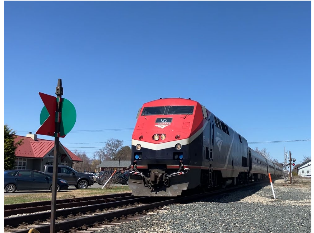
A Vermonter train in South Deerfield