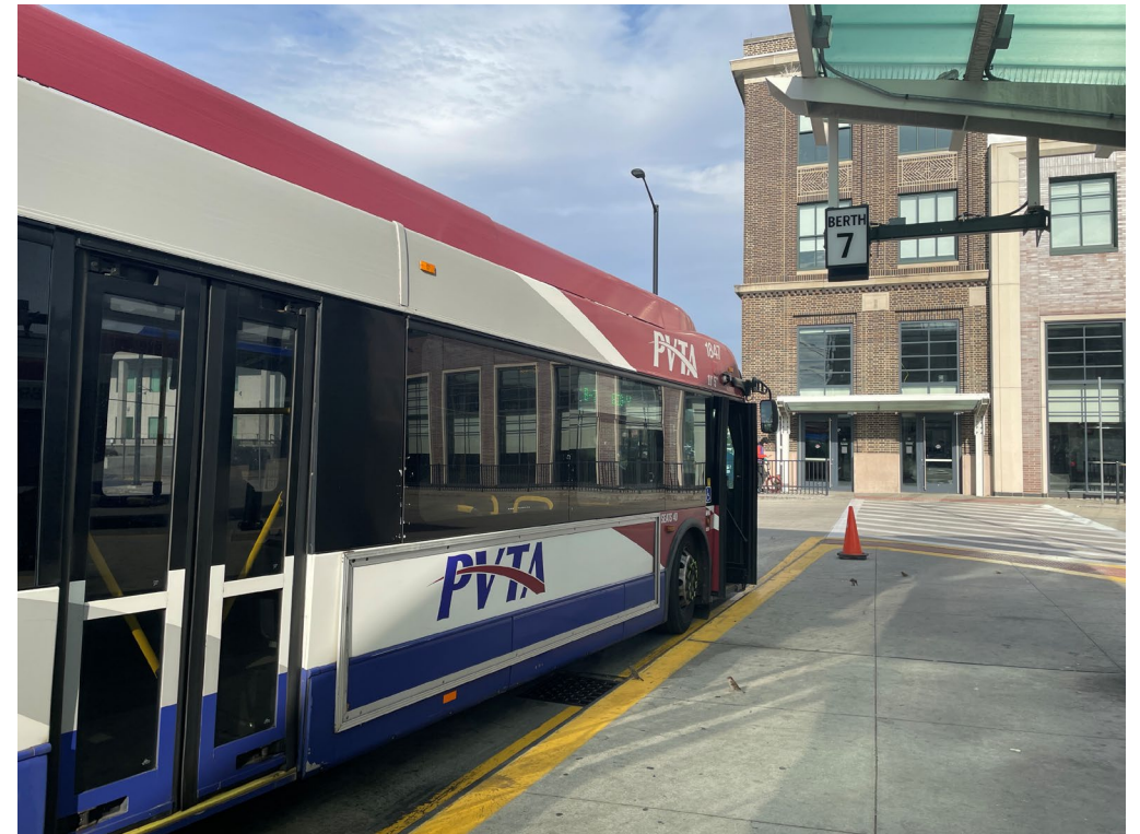
A Pioneer Valley Transit Authority (PVTA) bus outside of Springfield Union Station. PVTA is one of the larger RTAs in the Commonwealth.