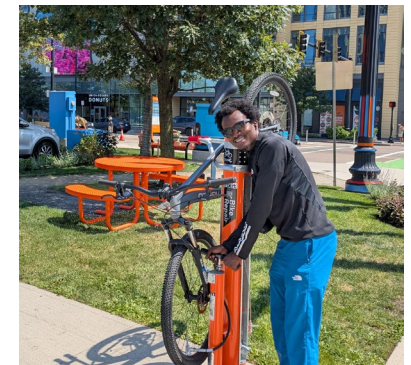
Wayfinding, bus stop, and bike improvements as part of an Assembly Connect mobility hub pop-up funded through an FY25 TMA Grant