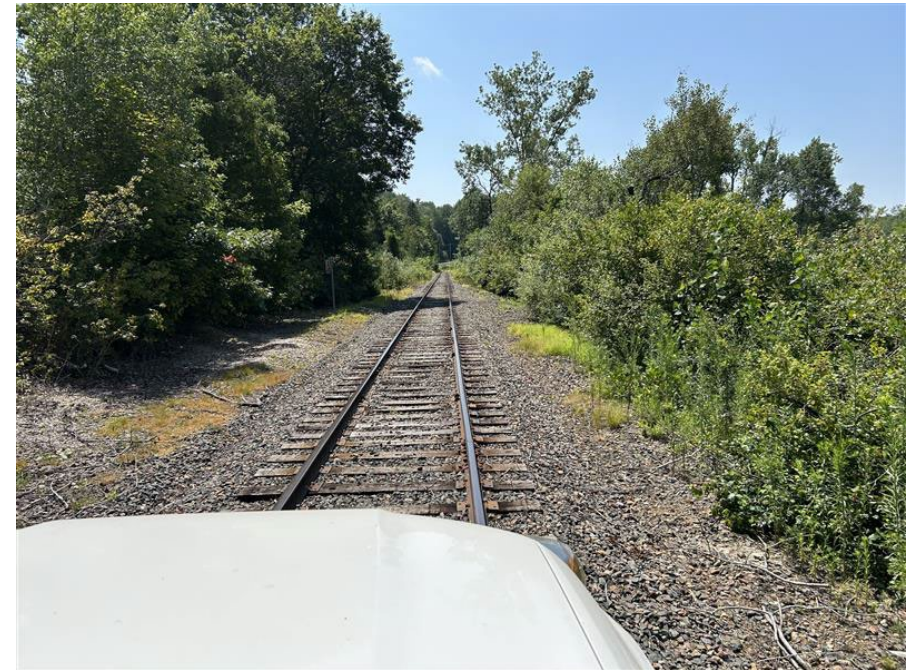
The Ware River Secondary track in Ware.