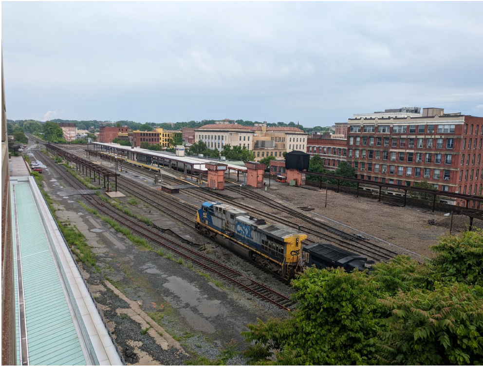
Springfield Union Station track configuration as seen from the adjacent parking garage in May 2024.