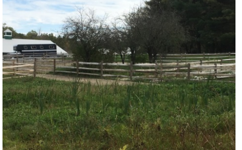
Figure 1 - View of the paddock area and the stable