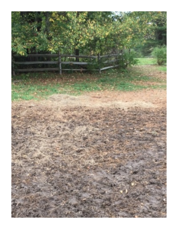
Figure 4 - Muddy area inside the paddock where the victim was found

The incident occurred at a horse stable in a rural setting with over 11 acres of land (Figure 2). The stable had barn space for boarding horses, paddock space, a barn with training space for jumping and hunter activities, and pasture area for riding. The stable consisted of a barn with 32 stalls, a large indoor riding/training arena, an area for riders to store their belongings, and a tack shop. There were multiple out buildings on the site as well, including a garage and storage buildings for hay and other items. There were 14 outdoor horse paddocks that were enclosed by fence. The paddock where the incident occurred was one of the furthest paddocks from the barn. This paddock had two horses in it at the time of the incident. It was reported by the stable owner that these two horses had been together in the same paddock for the past three months. One of these horses was an Appaloosa halter horse and the other was a Thoroughbred horse.