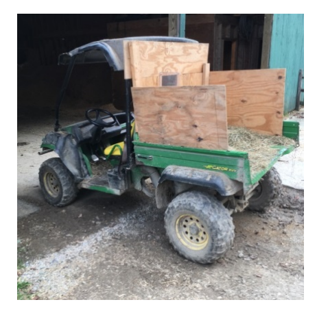
Figure 5 - Farm utility vehicle

The paddock where the incident occurred was built from a mix of wood and metal fencing and there was a metal gate for access to the paddock (Figure 3). The metal section of fence for this paddock was in the process of being replaced with wood fence. The new wood fence section was being installed outside of the perimeter of the old fence, which at the time of the incident created a gap between the new wood fence and the older metal fence. The ground of the paddock was a combination of areas of dirt, grass and vegetation. The area directly inside the paddock gate was primarily dirt due to the heavy foot traffic. The rain the day before the incident most likely contributed to the mud that was present in this area (Figure 4).