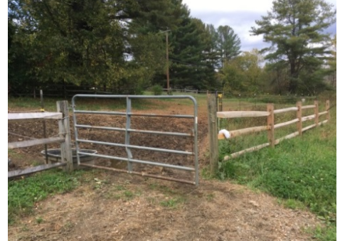
Figure 3 - Paddock where the incident occurred