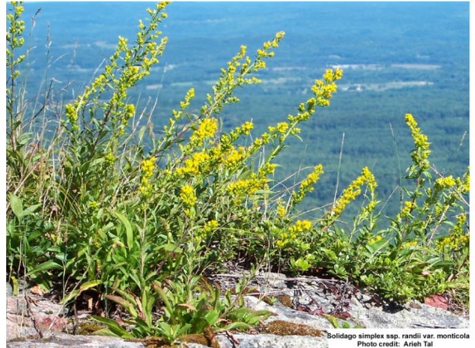
Solidago simplex ssp. randii var. monticola

AIDS TO IDENTIFICATION: Rand's Goldenrod stems are smooth (glabrous) except for a slight pubescence in the inflorescence. The basal and lower stem leaves are smooth, pointed, sparsely toothed, 5 to 10 cm (2 - 4 in.) long and 0.5-1.6 cm wide, widest above the middle, and tapered to the petiole. The upper stem leaves are smaller, narrower, and entire or slightly toothed. The plant's flowers are on ascending terminal