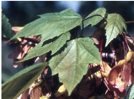
Red maple leaves.

and sweet pepper-bush. In southeastern Massachusetts, dense thickets of sweet pepper-bush are often bound together by greenbriers. The herb layer is often dominated by ferns such as cinnamon fern, sensitive fern, and royal fern, mixed with skunk cabbage, jewelweed, and sedges.