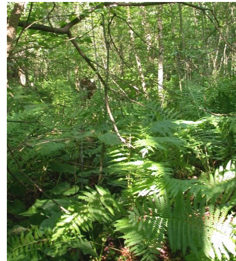
Red Maple Swamp with dense undergrowth in midsummer.

Red Maple Swamps literally occur state wide. Because they are so widespread and abundant, NHESP does not usually keep track of occurrences. Examples on public lands from the NHESP database are in the Quaboag WMA, West Brookfield, and Haskell Swamp WMA, Rochester.