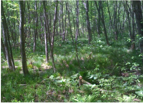
Red Maple Swamp with tussock sedges and ferns.

Description: Red Maple Swamps are broadly defined and some of the obviously recurrent variants (for example, Red Maple - Black Ash Swamp; Red Maple - Black Gum Swamp; Alluvial Red Maple Swamps, and others) are classified separately. Generally, occurrences remaining in the Red Maple Swamp category occur in seasonally flooded basins or on slopes with groundwater seepage. Soils are shallow to thick organic layers overlying mineral sands/silts. Standing water is often present in the spring and the substrates remain saturated throughout the growing season. Most sites are relatively low in nutrients and somewhat acidic. Vegetation is strongly influenced by water dynamics.