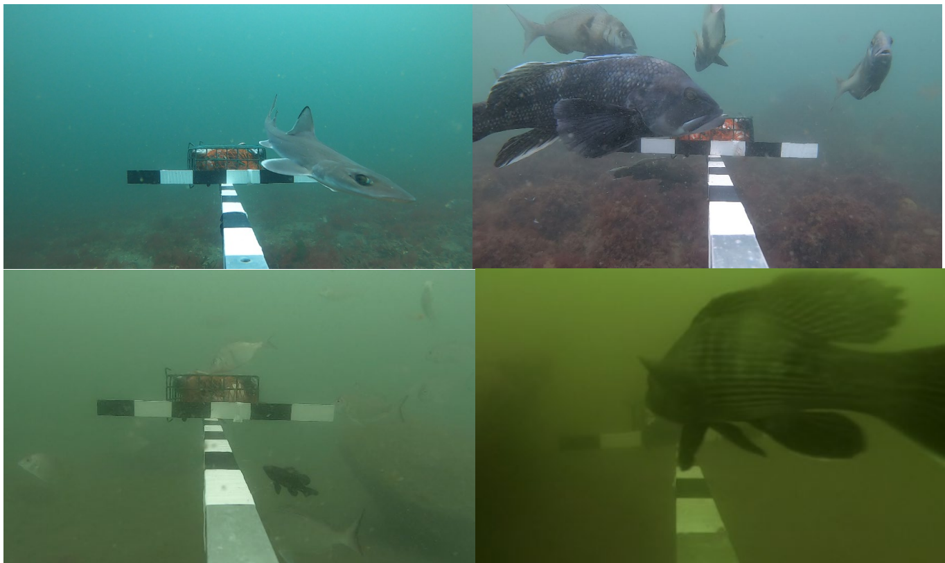
Figure 2. Still images taken from 2022 BRUV footage. Top Left: dogfish at Bare Sand Control Site. Top Right: black sea bass and scup at Natural Rock Reef. Bottom Left: scup and black sea bass at Yarmouth ILF 2022 site. Bottom Right: black sea bass at ILF site. (Note poor visibility in some photos).