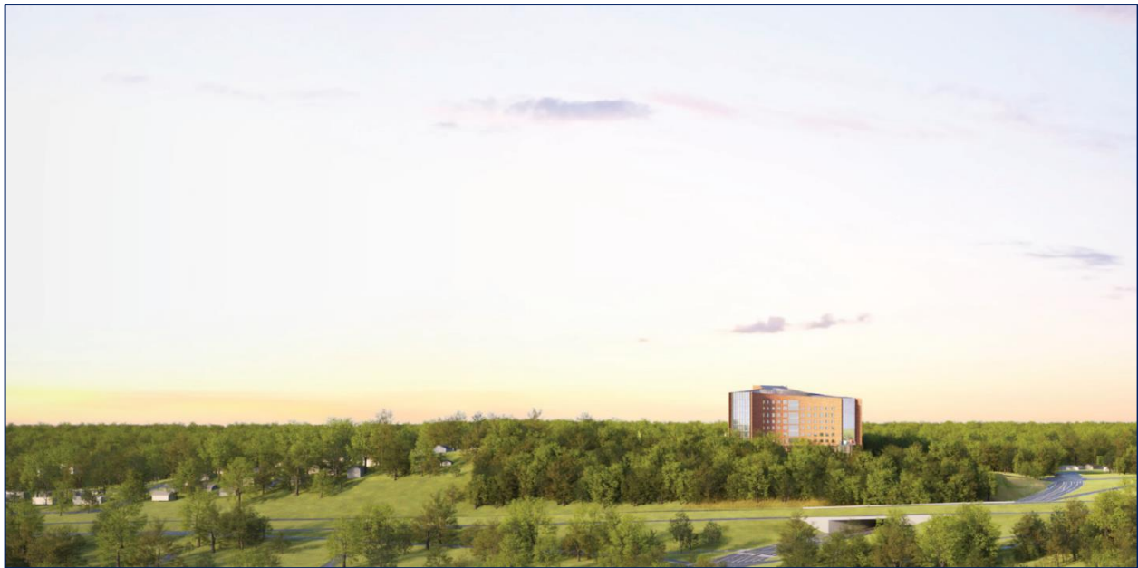
Massachusetts Veterans Home at Holyoke Rendering

Please disclose any conflicts of interest, in writing, to the review committee who will consider the nature of the respondent's responsibilities and the degree of potential or apparent conflict in deciding the course of action that the respondent needs to take to remedy the conflict of interest. Examples of potential conflicts of interest include, but are not limited to: a relation through kinship to a member of the Review Committee, etc.