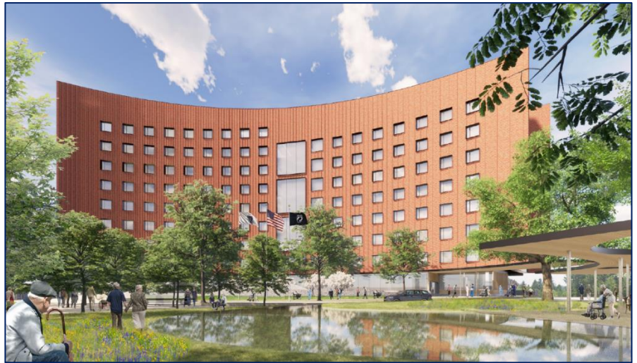
Massachusetts Veterans Home at Holyoke Rendering | Payette Architects

The new, 350,000 +/- GSF building is currently under construction, and will act as a long term care facility for 234 full time residents. It will also have an adult day program capable of serving 40-50 veterans from the community. The Veterans Home will deliver services and programs more effectively, meeting current and future quality of life standards for veterans.