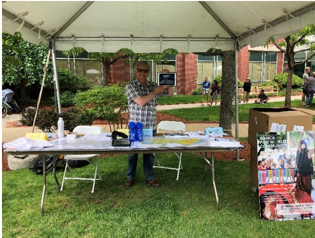
2019 Cambridge River Festival Climate Action Extravaganza, June 1, 2019

were featured there. Attendees were engaged with maps showing climate change risks in Cambridge; the Cambridge Floodviewer (on a laptop) which is an interactive map that identifies flood risks at the parcel level for the present, 2030, and 2070; and a virtual reality visualization using a headset of flood risks and action in The Port neighborhood. People at the event were engaged with the information about climate risks through the various media and discussion with City staff, and then presented with the toolkits which they could take. One lesson the City learned is that we need to develop a digital method to convey the toolkit information, perhaps through an app.