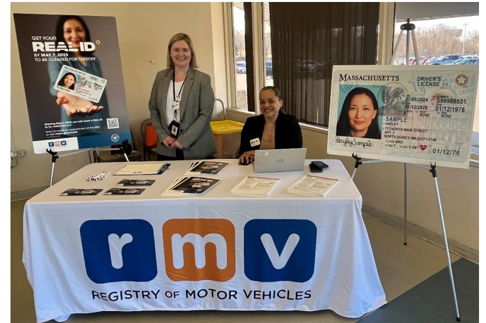
RMV at Logan Express in Braintree promoting REAL ID