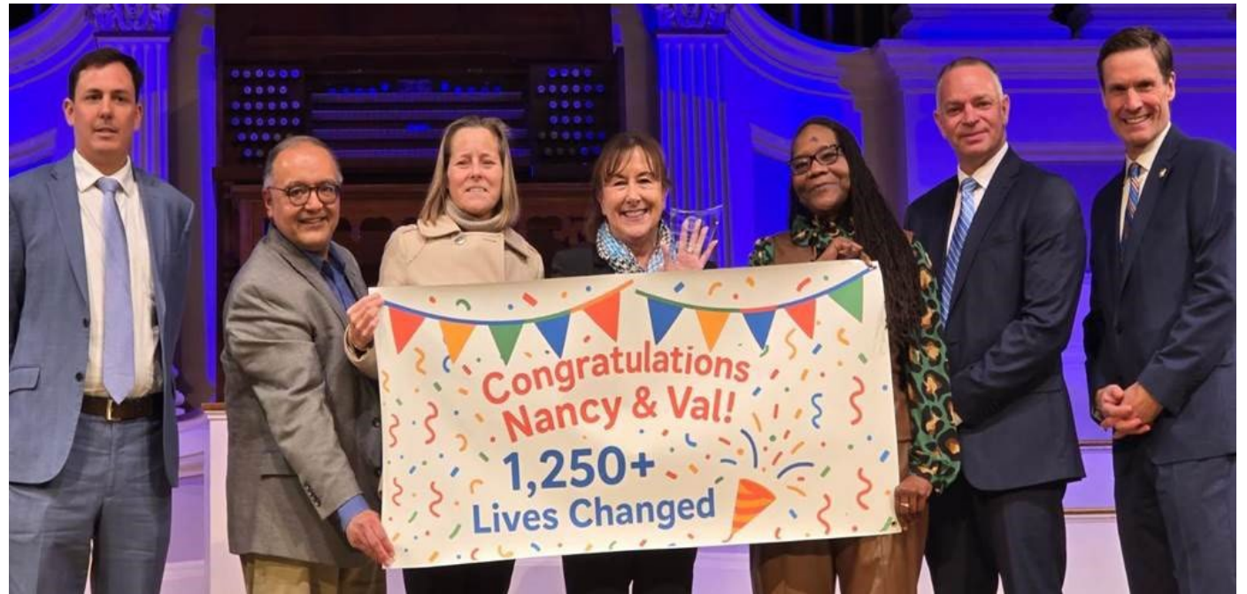
"Innovations in Public Safety Partnership Awards" for RMV's Enhanced State ID Program with the Department of Corrections on November 17 th .