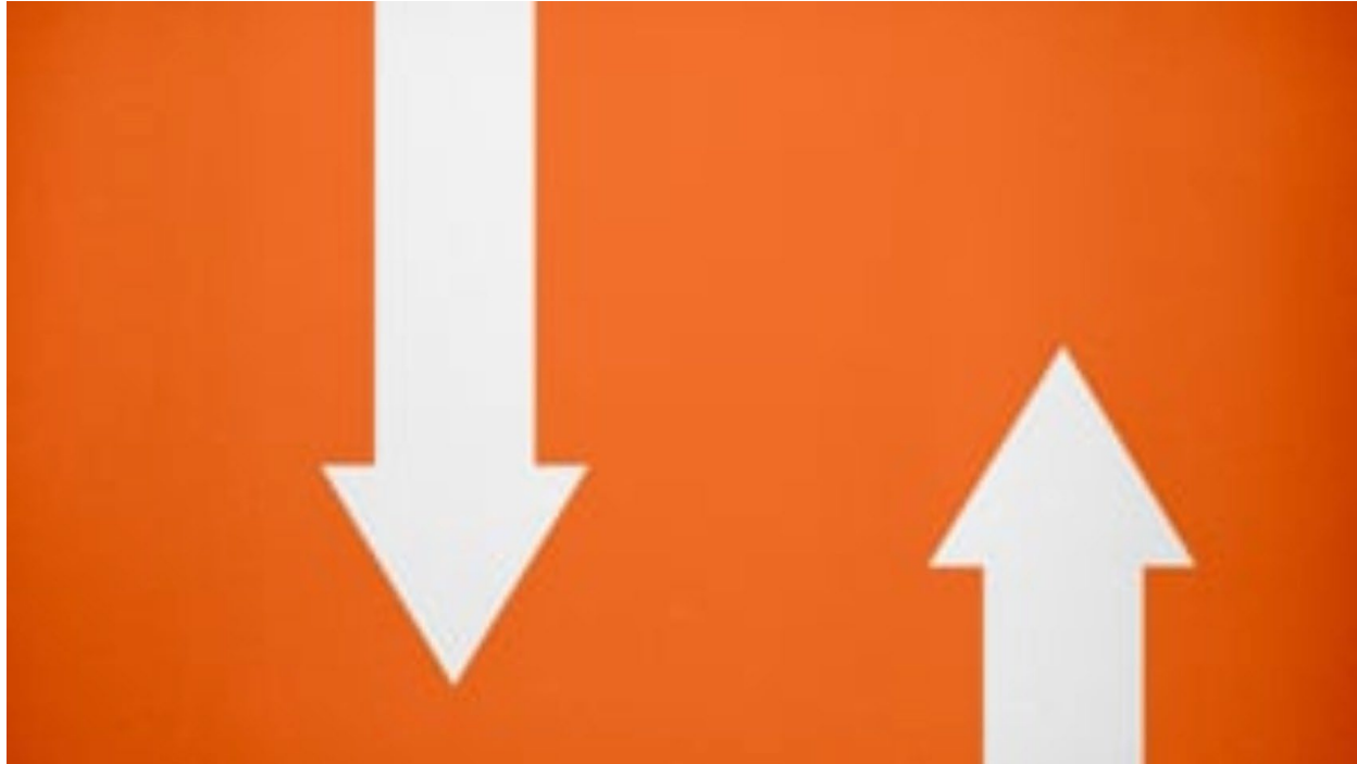
Look Before You Left PSA