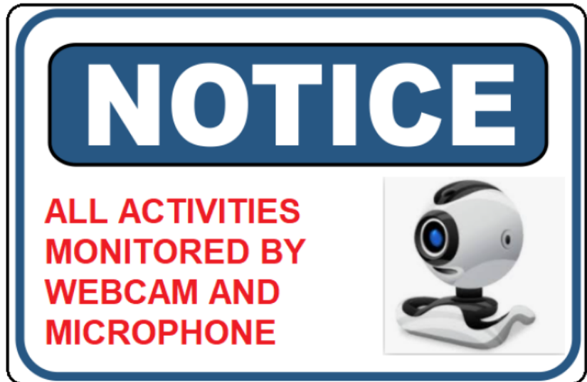
Figure 1: You must face your webcam; such that, your entire face and eyes are captured by your webcam. If we cannot see your face and eyes but are seeing only forehead or the top of your head, you will be disqualified!

↓ If at any point you are not visible via the webcam or are repeatedly looking down or away from the computer screen, you may be found to be cheating and disqualified .