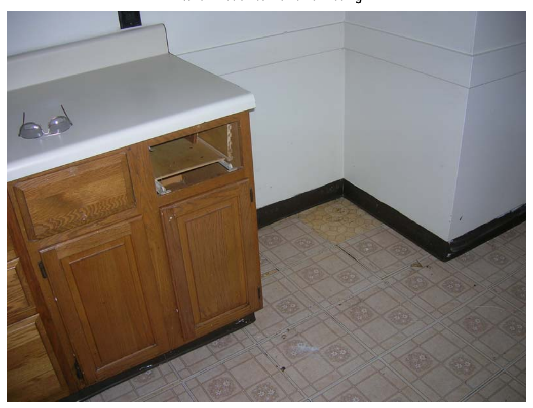
200-2 Family Housing Development, 9 Rainbow Terrace Kitchen – Countertop is Burnt

200-2 Family Housing Development, 9 Rainbow Terrace Kitchen – Cabinet Drawer is Missing