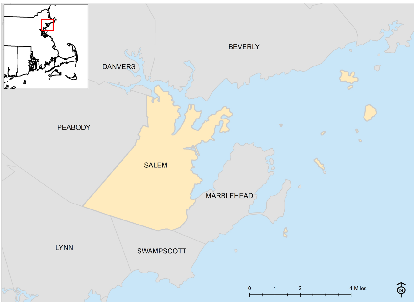
Salem Municipal Boundary

Map created by the Urban Harbors Institute, UMass Boston With data from MassGIS, March, 2021