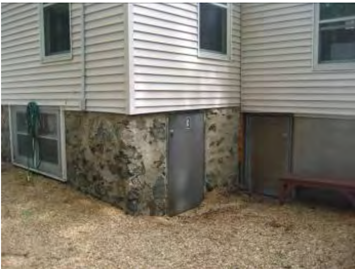
Side B, Door 3 and Door into Storage