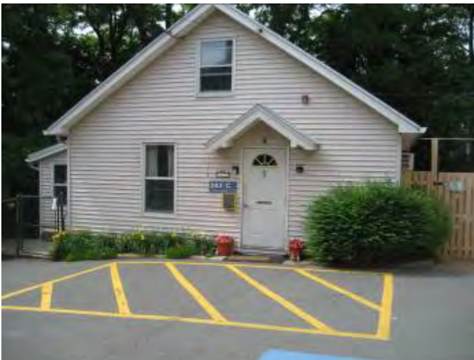
Side A, Door 1 with Knox Box and Callbox