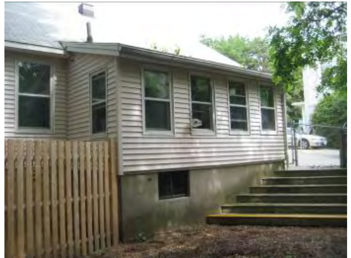
Side B, From C