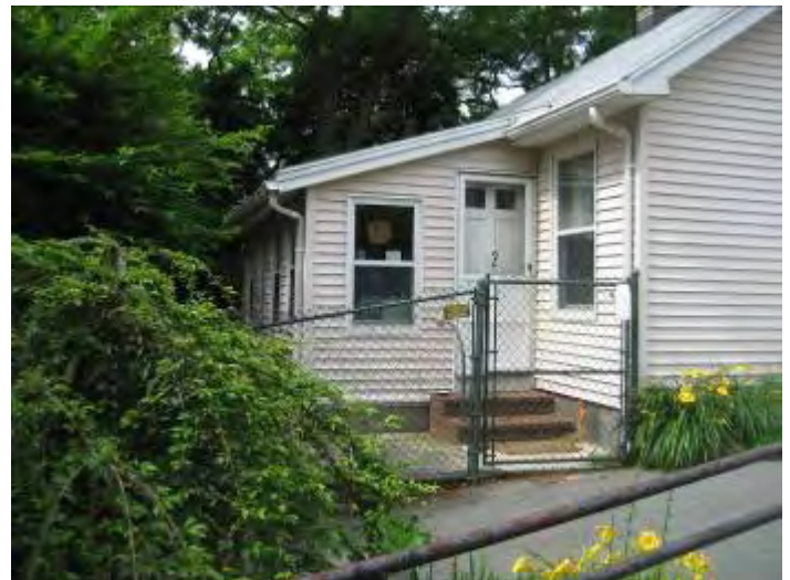
Side A, Door 2