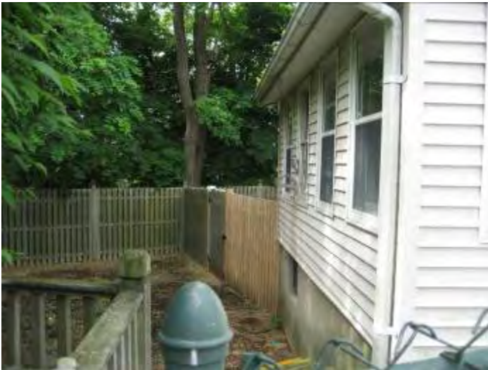
Side B, From A