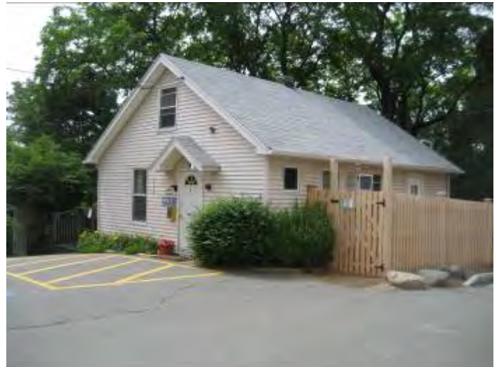
Side A, From D