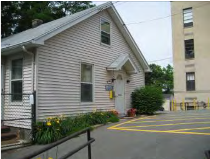
Side A, From B