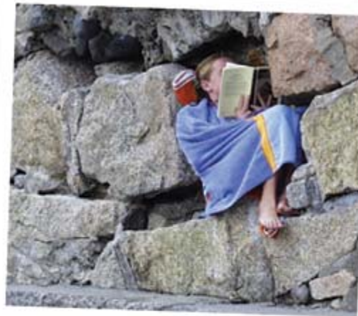
PHILLIPS BEACH - BOOKS ARE OPTIONAL...

Gerry Playground (Stramski Beach) - Grassy park with storage area for small boats (with permit), small-boat launching area, benches, picnic tables, grills, and playground. Access via Stramski Way off West Shore Drive. Resident sticker parking lot.