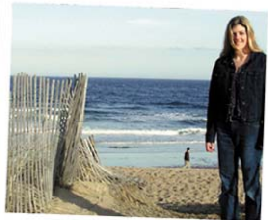
SALISBURY STATE RESERVATION

Facilities include a 481-site campground with newly renovated bathhouses, an extensive day-use parking lot, three new comfort stations, boardwalks over the dunes, a new playground, and pavilion area. The facility also has two boat ramps that are located on the Merrimack River at the campground's southern edge.