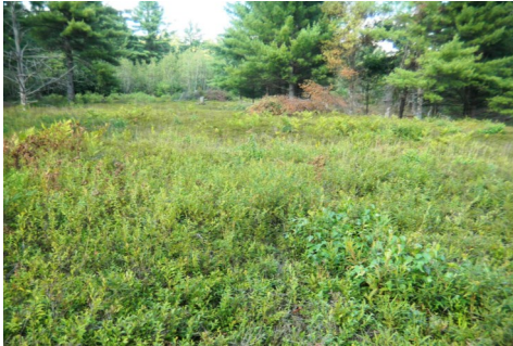
Sandplain Heathland - Inland Variant where invading pines are being removed.

Description: Sandplain Heathlands - Inland Variant occur away from the coast, on sand or gravel deposits including dry riverside bluffs (20 to 50 foot high erosional gravel cliffs next to rivers). The rugged environment has intense sunlight, extreme daily and seasonal temperature variations, and nutrient-poor droughty soils. Like coastal Sandplain Heathlands, the Inland Variants are open, nearly treeless shrublands often dominated by low-growing shrubs. Plant cover ranges from nearly continuous to sparse with bare soil or lichen between clumps of plants. Some occurrences are variably sized openings in Pitch Pine - Scrub Oak Communities, often in depressions (frost pockets) on sandplains where unpredictable late season frosts inhibit growth of many species, including most trees. Other pre-European settlement