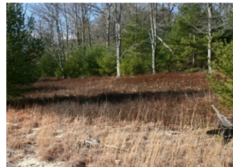
Linear Sandplain Heathland - Inland Variant along the shore of the Quabbin with dense lowbush blueberry mixed with grasses.

Montague Plains WMA, Montague; Barre Heathland, DCR Ware River Watershed Area, Barre; Clinton Bluff WMA, Clinton.