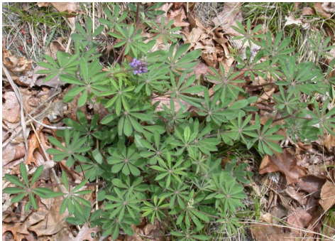
Lupine growing in a Sandplain Heathland - Inland Variant.

occurrences were likely small patches in successional mosaics on drought-prone soils maintained by disturbances including fires. Current occurrences were likely enlarged or created by past land use - land clearing and farming - on low nutrient soils. Fire has been important in at least, some situations, especially on drier south and southwest facing slopes. Without disturbance or management, succession to woodland and forest occurs.