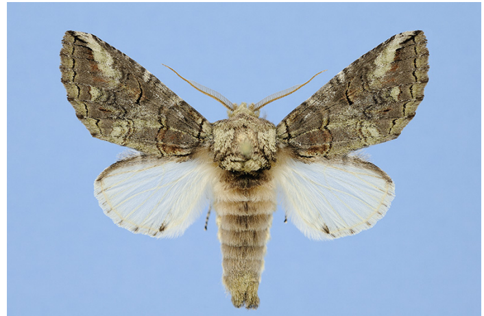
Heterocampa varia , male • Specimen from MA: Dukes Co., Edgartown, adult female collected 29 Jul 2008 by M.W. Nelson and T. Simmons, reared from egg, adult emerged 26 Jul 2009

DESCRIPTION: The Sandplain Heterocampa ( Heterocampa varia ) is a sexually dimorphic notodontid moth. Males are smaller, with a wingspan of 37-42 mm, and have a white hind wing with a gray costal margin (figured at top right). Females are larger, with a wingspan of 42-46 mm, and have a hind wing that is light gray proximally and dark gray distally and along the costal margin (figured at bottom right). In both sexes, the anal angle of the hind wing has a black dot. The forewings of both sexes are similar: the ground color is gray to olive green, with a lighter apical patch ranging from pale green to cream-colored. Many individuals have reddish-brown shading distal to the pale apical patch, in the area of the reniform spot, and/or proximal to the antemedial line. There is a black, scalloped terminal line, and black dashes may be present in the subterminal area. Both postmedial and antemedial lines are black in color and consist of double, parallel lines; the postmedial line is jagged and the antemedial line is wavy. The basal line is black, single, and relatively straight. There is a black apical dash, and the reniform spot is reduced to an angled black dash. Both sexes have an olive green head and thorax, and a grayish-tan abdomen. The male of a common congener, the Oblique Heterocampa ( Heterocampa obliqua ), is so similar in wing pattern to the Sandplain Heterocampa that