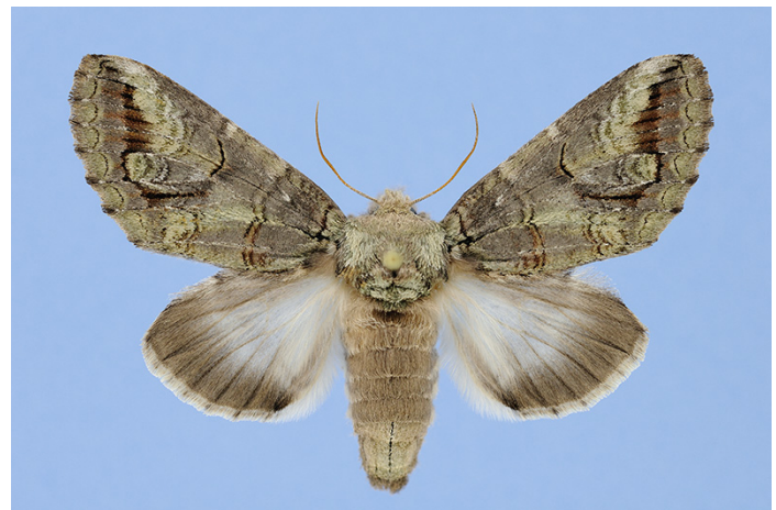
Heterocampa varia , female • Specimen from MA: Dukes Co., Edgartown, adult female collected 29 Jul 2008 by M.W. Nelson and T. Simmons, reared from egg, adult emerged 9 Jul 2010