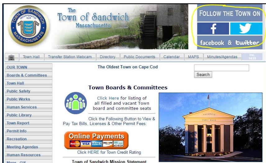
Update: Sandwich added a link to Twitter on the Town website. It is conveniently located next to the Facebook icon, in the upper right-hand corner.