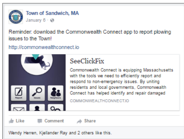
Screenshot: SeeClickFix promotional post taken from the Town of Sandwich Facebook page.

The Town of Sandwich launched Commonwealth Connect, their new SeeClickFix solution, in December of 2016. The Town promoted the citizen request tool by disseminating information about the platform on their social media pages and through other communication channels. With the technology solution in place today, DPW requests are now centralized and placed into a queue making them easier for the DPW to track and resolve. Sandwich's DPW finds the new and improved request intake process to be much more streamlined.