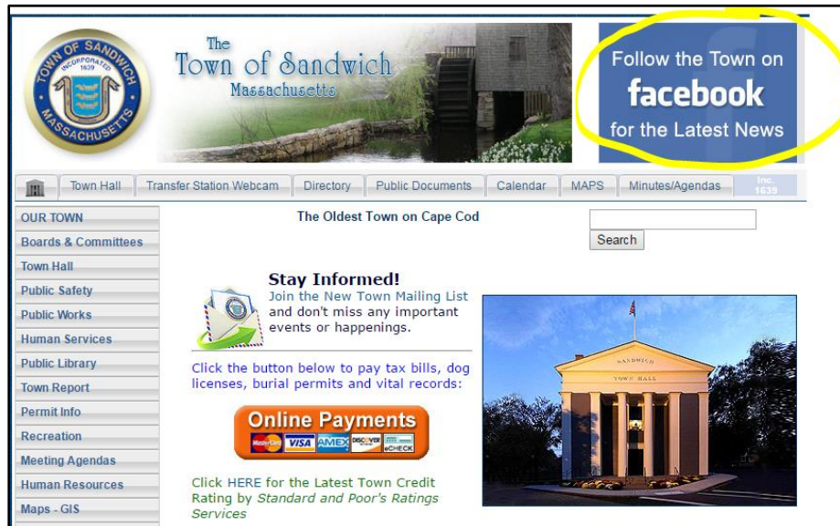
Screenshot: Sandwichmass.org - Home Page (Taken August 16th, 2016)