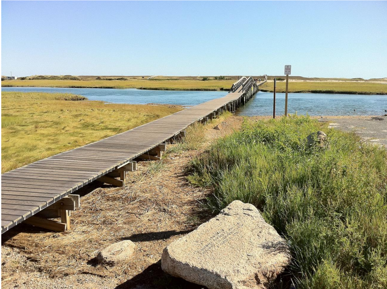
Image: Boardwalk at Sandwich, MA 1