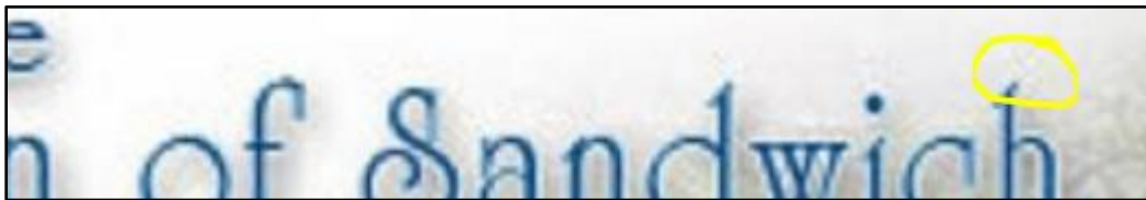
Screenshot: Image Pixelation - Sandwich Twitter (Taken December 9th, 2016)