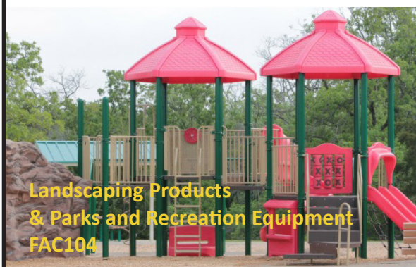
Landscaping Products & Parks and Recreation Equipment FAC104

Environmentally Preferable Cleaning Products, Programs, Equipment & Supplies FAC118