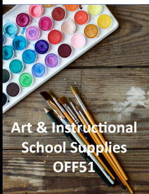
Art & Instructional School Supplies OFF51

Foreign Language Interpretation & Translation Services PRF75