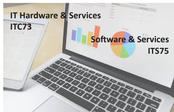
IT Hardware & Services ITC73

Landscaping Services, Snow Removal, Tree Care and Related Services FAC120