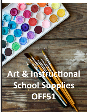
Art & Instructional School Supplies OFF51

Foreign Language Interpretation & Translation Services PRF75