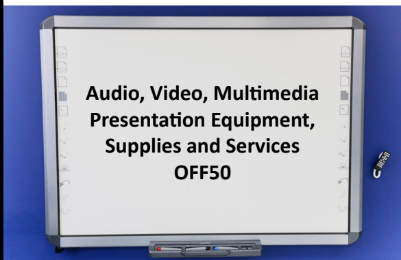
Audio, Video, Multimedia Presentation Equipment, Supplies and Services OFF50

Office Supplies, Recycled Paper and Envelopes OFF53