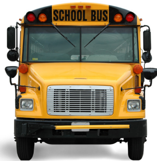
Light and Medium-Duty Vehicles VEH110

Office, School & Library Furniture OFF52