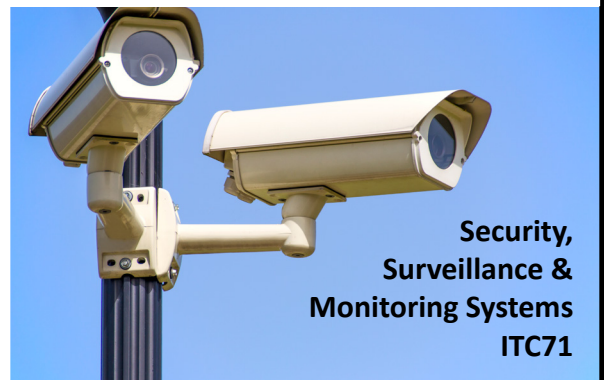
Security, Surveillance & Monitoring Systems ITC71

Multi-Function Devices and Related Services ITE001