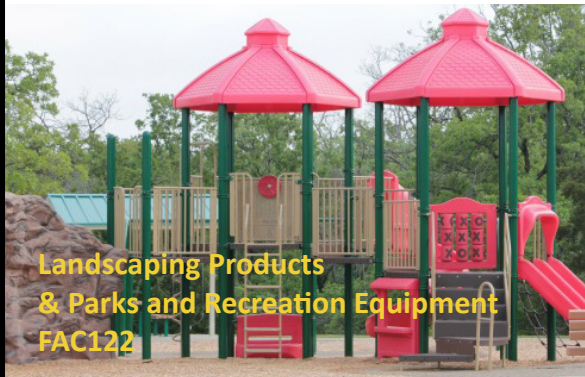
Landscaping Products & Parks and Recreation Equipment FAC122

Environmentally Preferable Cleaning Products, Programs, Equipment & Supplies FAC118