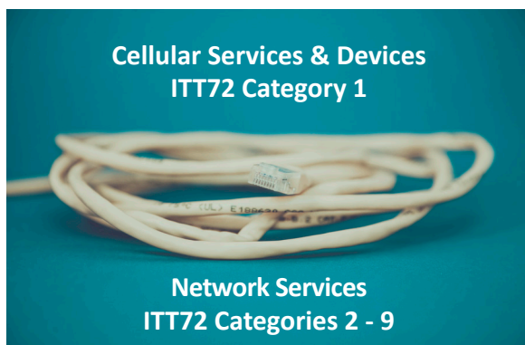
Cellular Services & Devices ITT72 Category 1

Foreign Language Interpretation & Translation Services PRF75