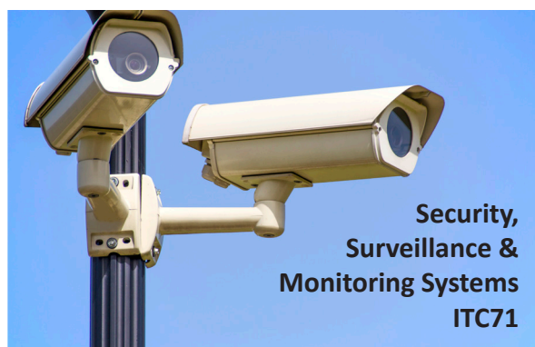
Security, Surveillance & Monitoring Systems ITC71

Imaging Devices, Supplies and Services ITC80