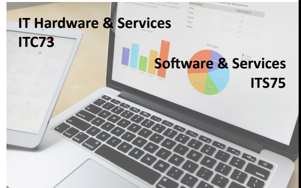
IT Hardware & Services ITC73

Landscaping Services, Snow Removal, Tree Care and Related Services FAC120