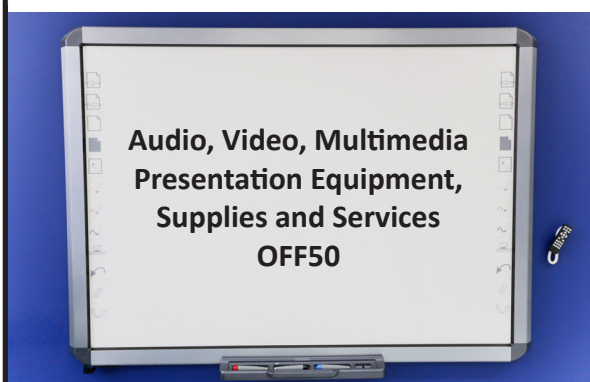
Audio, Video, Multimedia Presentation Equipment, Supplies and Services OFF50

Office Supplies, Recycled Paper and Envelopes OFF47