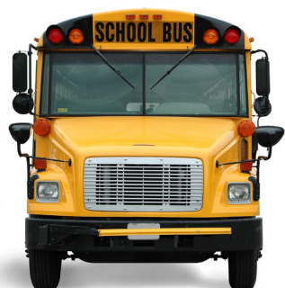
Light and Medium-Duty Vehicles VEH110

Office, School & Library Furniture OFF38