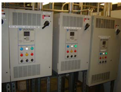
Variable Frequency Drives

In an earlier case study published in 2008, OTA reported that Seaman Paper had established an aggressive energy conservation program that led to significant reductions in both energy use and operating costs. This program included replacing lights with more energy efficient lighting, using variable frequency drives on various motors, and the installation of a heat exchanger. These projects reduced annual electrical energy use by 3 million kWh, and fuel oil consumption by 480,000 gallons, and saved a total of $1.44 million.