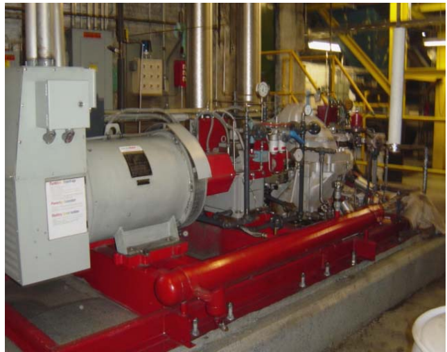
Backpressure Steam Turbine

Backpressure Steam Turbine: In 2009, Seaman Paper also installed a backpressure steam turbine, to generate electricity and process steam for the plant. Superheated steam from the wood-fired boiler is expanded through the turbine/generator producing electricity at a cost far below the current utility rate. The turbine exhaust steam is used in the paper making process. From 2009-2011, the backpressure generator produced more than 3,000,000 kWh of electricity, reducing annual energy costs by more than $200,000 through lower fuel costs and the sale of Renewable Energy Credits (RECs) for the electricity it produces. This also amounted to a 5,892,000 pound reduction in annual CO 2 emissions.