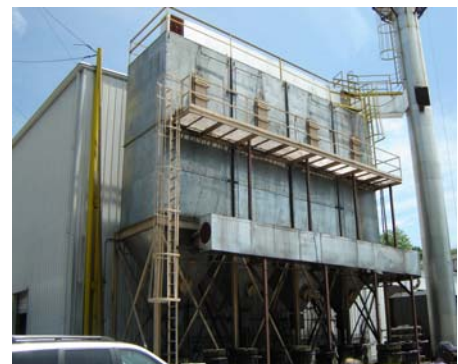
Bag House Filter