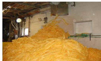
Paper produced by Seaman Paper

Seaman Paper Company of Massachusetts, Inc. is a privately owned paper company located in Otter River, employing 100 people. The plant operates around 350 days a year, seven days a week, producing on average 70 tons per day of decorative tissue paper. Some of the paper produced in Otter River is transferred to nearby plants in Gardner and Orange for printing and converting into specialty products. Seaman produces tissue reams, crepe streamers, tissue gift wrap and waxed foodservice papers.