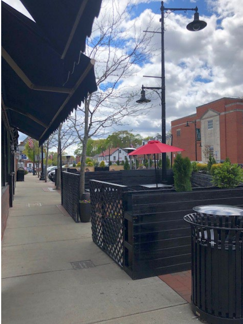
Dedham -outdoor dining installed with grant money.