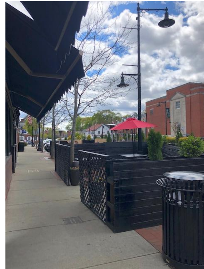
Dedham Center Shared Streets funding site.