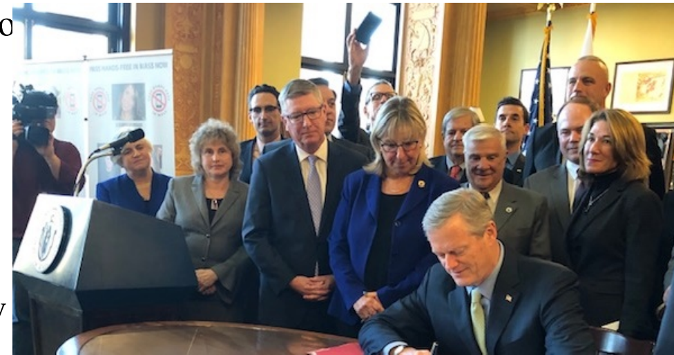
The signing of the bill at the State House on November 25. State officials, representatives from advocacy groups, and officials from the National Transportation Safety Board were in attendance.