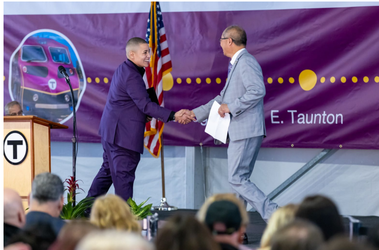
South Coast Rail March 24