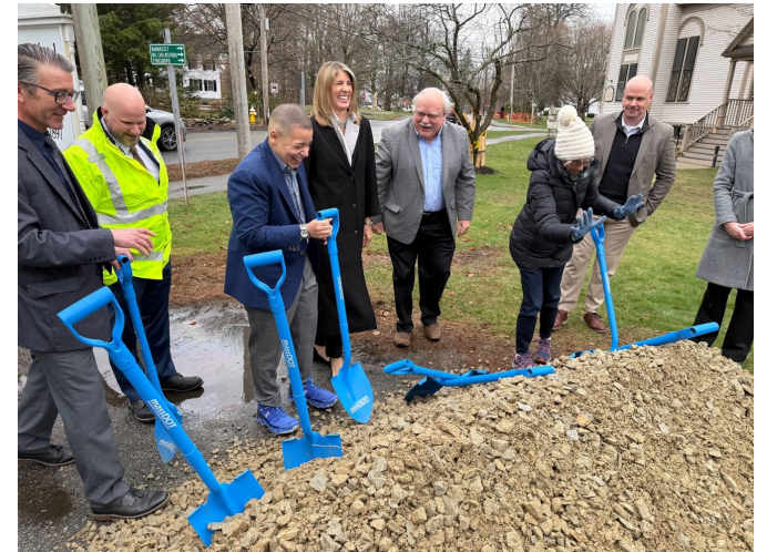
Westford April 7