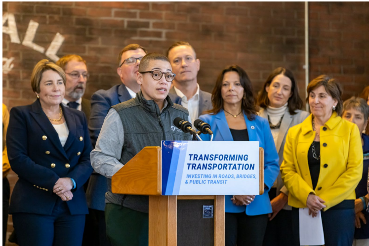
Lenox/Becket March 18