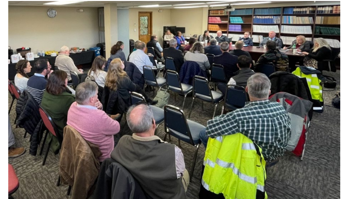
D1 Community Meeting