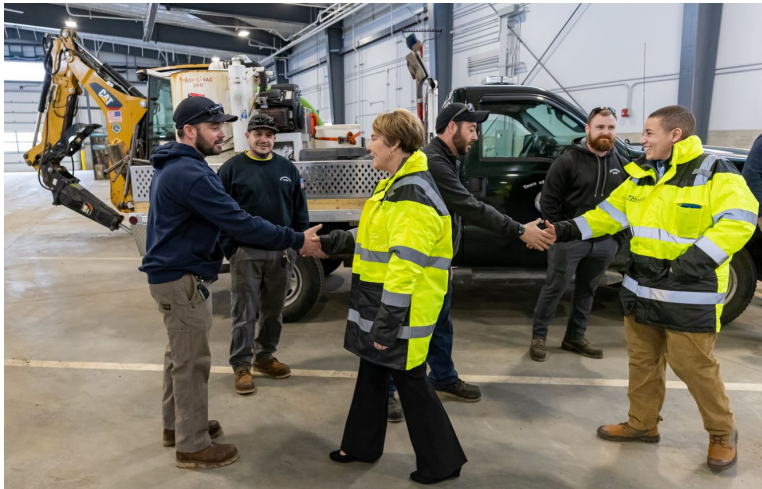
Burlington DPW Chapter 90 Investments