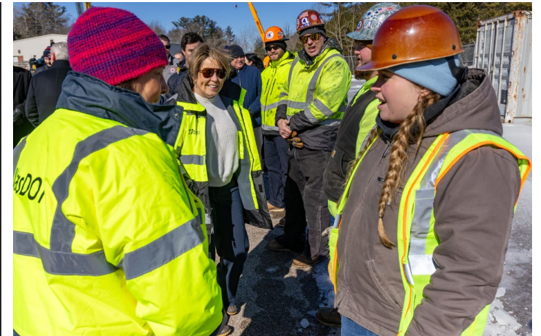
Medway IUOE Local 4 Jobs in Infrastructure