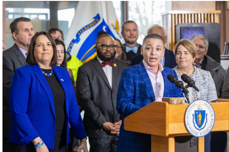
Brockton Area Transit RTA Investments