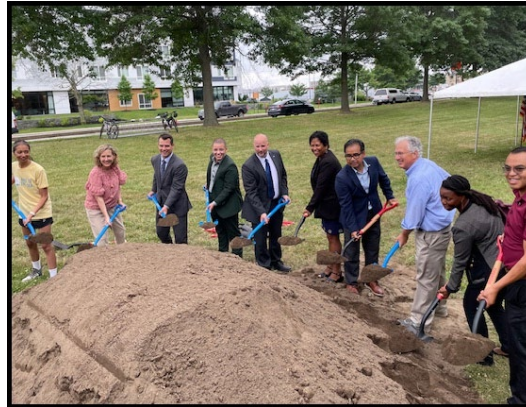
Northern Strand Trail