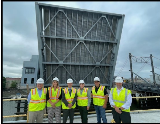
Belden G. Bly Bridge