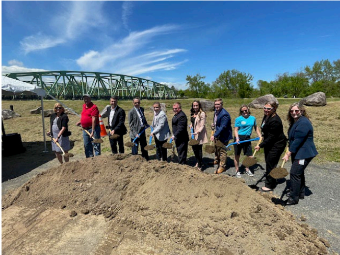
Westfield May 13