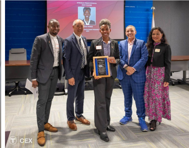
Boston May 30