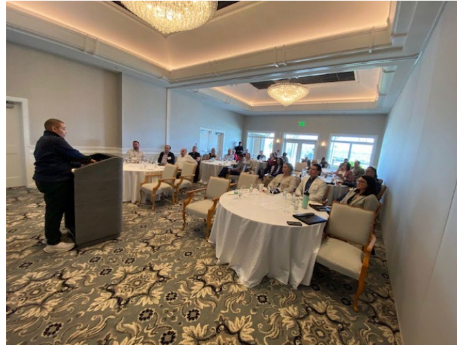
Harwich May 17