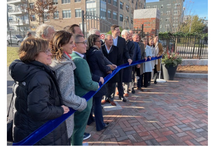
Piers Park II Ribbon Cutting December 15 East Boston