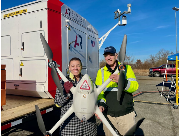
Drone-In-A Box Demo December 8 Lynn