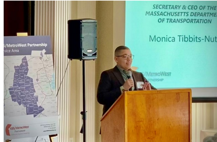
MetroWest Regional Transportation Summit December 12 Framingham