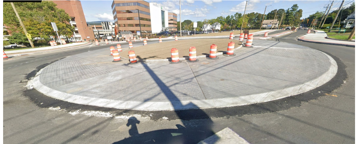
First Street at North Street Roundabout Ribbon Cutting