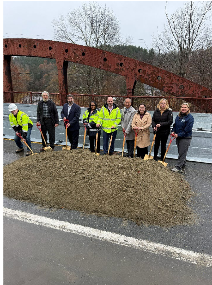
Rt 9 Bridge Replacement Groundbreaking