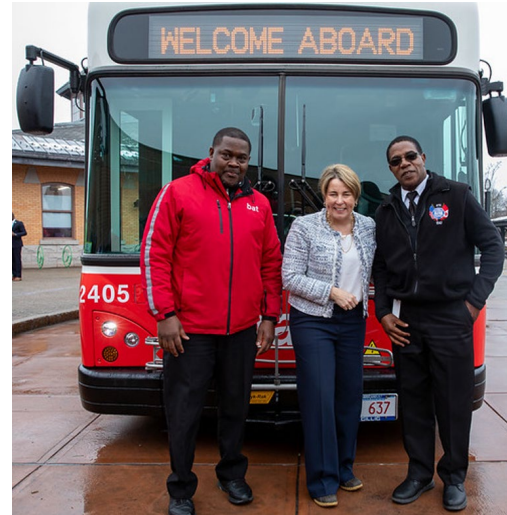
Rail & Transit