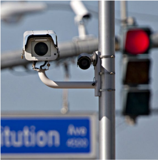
Automated Speed Enforcement in Work & School Zones