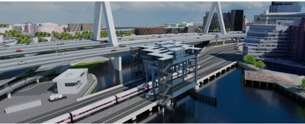
Progressive Design Build