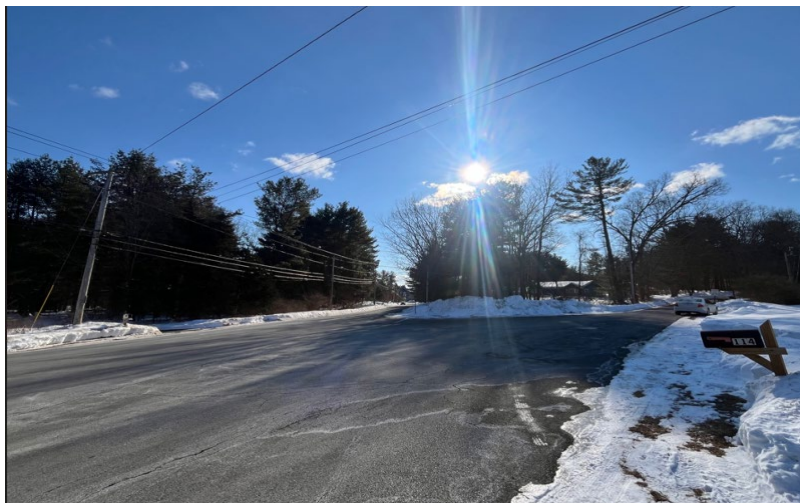
Main Street at Oak Street, Dunstable