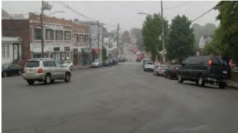
Washington Avenue, Chelsea

Local Early and Actionable Planning (LEAP) Grants