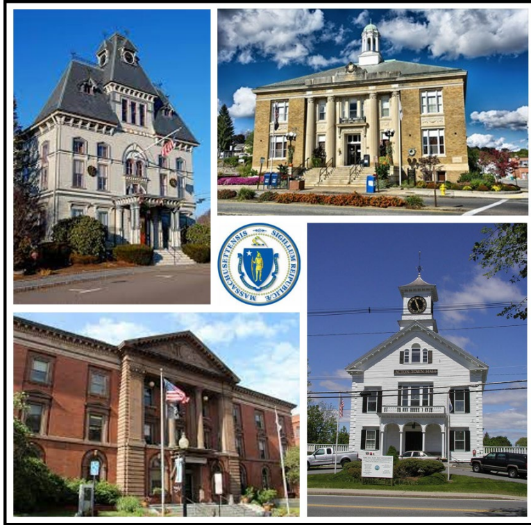
Municipal Empowerment Act