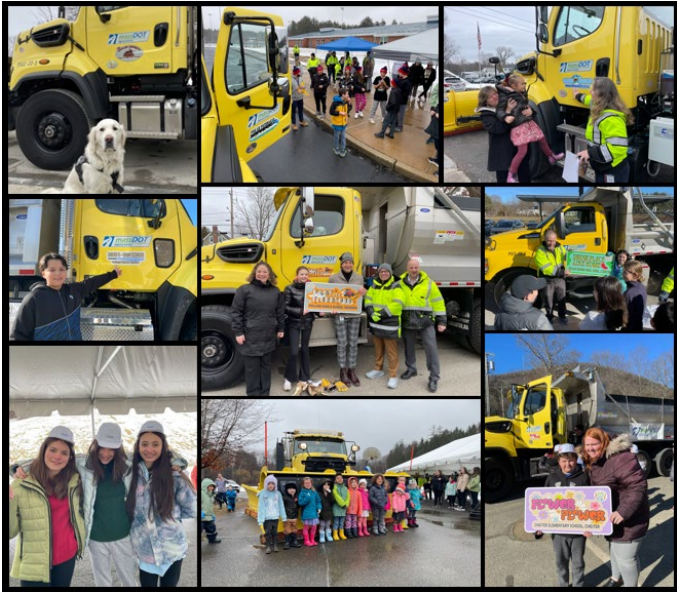
Name A Snowplow