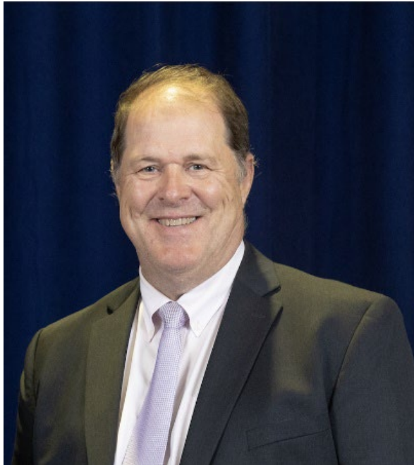
Gus Bickford Chief of Intergovernmental Affairs