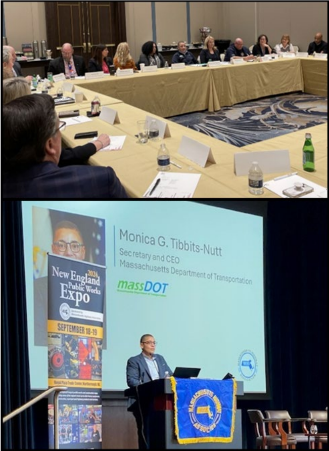
AIM Roundtable Springfield & Mass Highway Winter Meeting