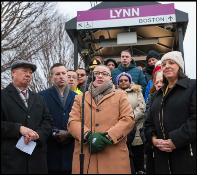
Lynn Commuter Rail