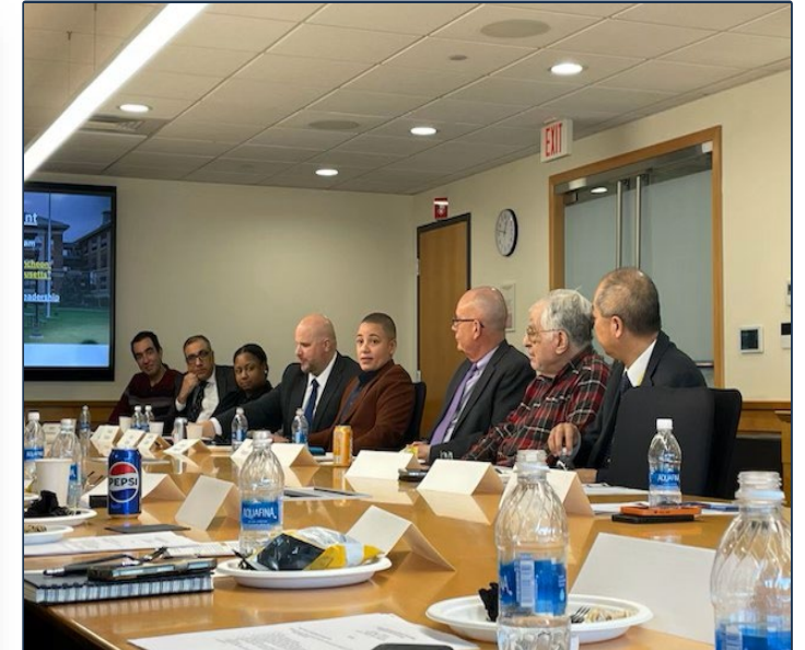
Wentworth Transportation Infrastructure Luncheon March 14