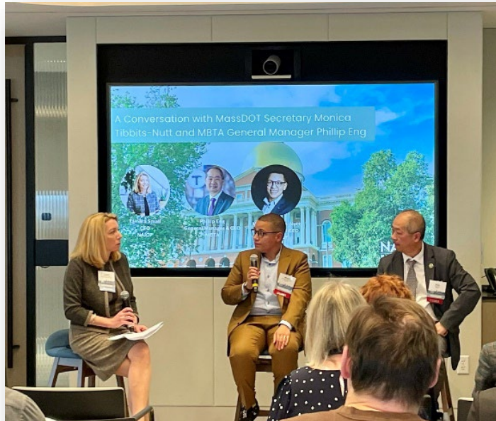
NAIOP March 4