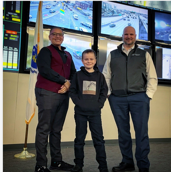
"The Scoop" Podcast March 11