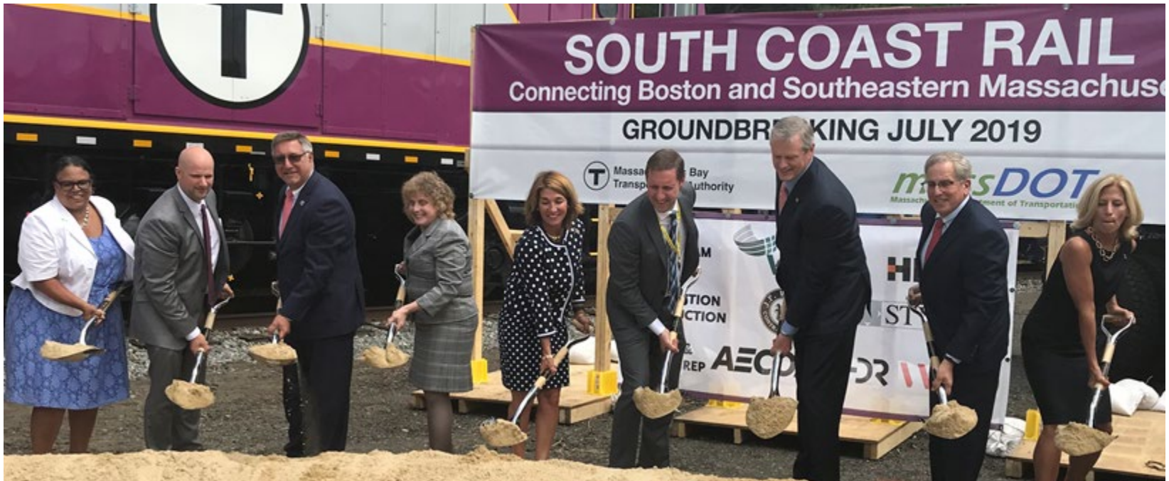
July 2: official groundbreaking for Phase 1.