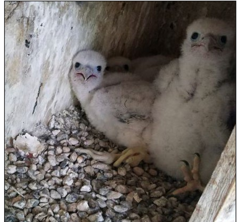
Photograph of Peregrine Falcon chicks in a nesting box