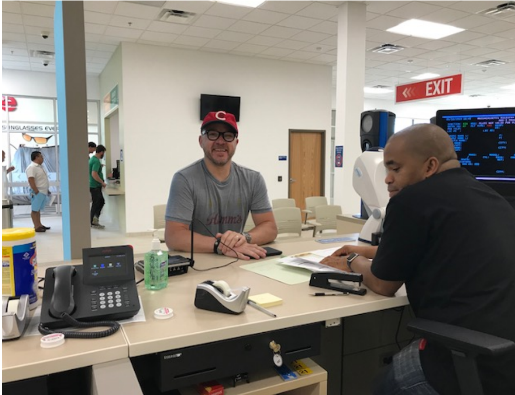
Photograph: First customer served in new Watertown Service Center