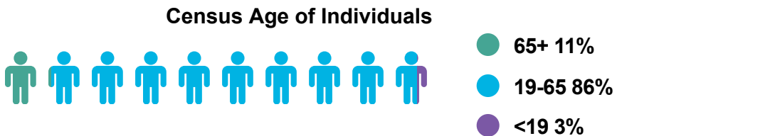
Census age of individuals: Under 19 years old 3%, 19 through 65 years old 86%, over 65 years old 11%