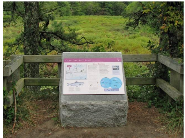
River Herring interpretive panel along the CCRT, at Herring River, Harwich. The panel’s design and stone mount are characteristic of interpretive materials along the CCRT. (See Appendix G for photo information.)

These waysides are attached to granite blocks similar in appearance to those used for benches at trailheads.