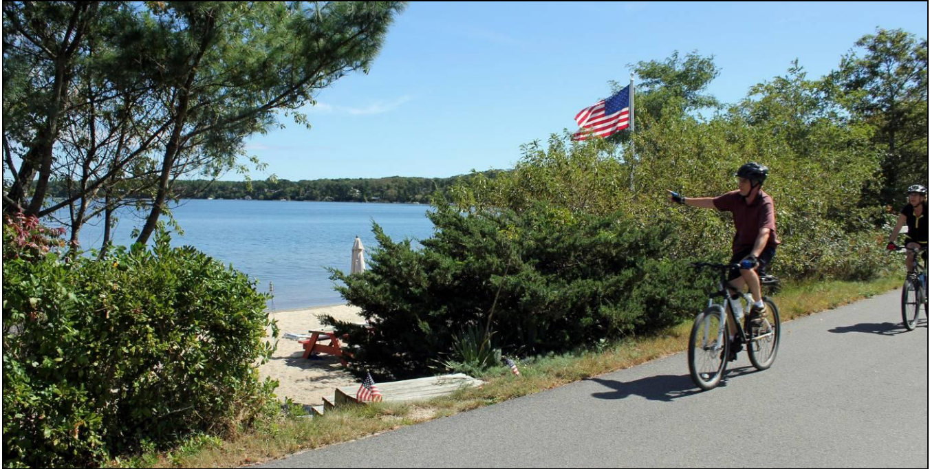
Cyclists on the Cape Cod Rail Trail, near Long Pond, Harwich. (See Appendix G for photo information.)