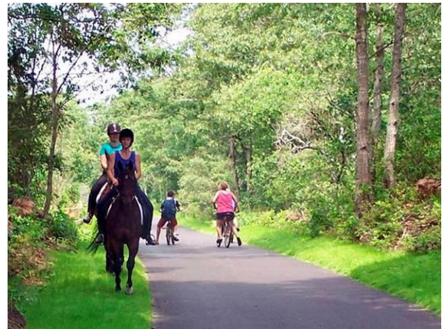
The CCRT's paved multi-use path provides a hardened surface for runners and cyclists, while the grassy shoulders function as bridle trails. (See Appendix G for photo information.)

Adjacent to the multi-use path is a grassy shoulder intended for use as a bridle trail; it is not regularly maintained. As a result, equestrians and their horses need to travel along the paved multi-use trail for portions of the CCRT.