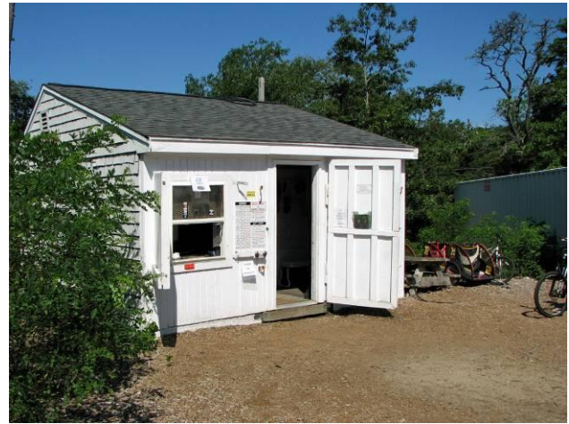
Bike rental concession along the CCRT, Route 6A, Brewster. (See Appendix G for photo information.)

There are only three buildings in the park. Two are associated with composting toilets, and the third is used as a bike rental concession. (Table 9.5.1) A comfort station is located in the Nickerson day use lot along adjacent to the CCRT; it is covered in Section 8.