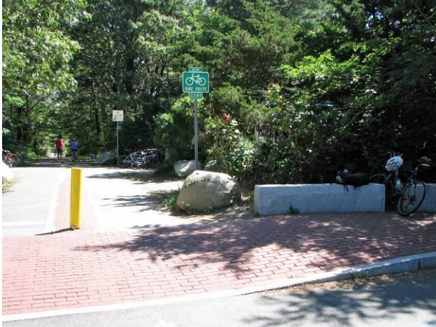
Standard CCRT trailhead features include a brick apron, stone benches, and engraved stones. (See Appendix G for photo information.)