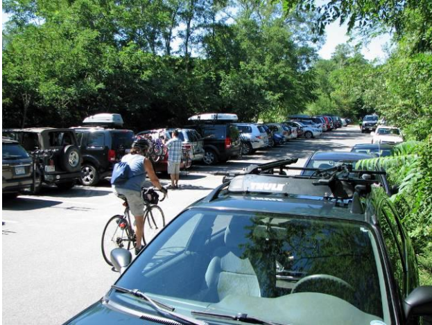
Illegal parking (right) at the Wellfleet trailhead lot makes access to marked spaces difficult. (See Appendix G for photo information.)

Additional parking is available in municipal lots in Orleans at Depot Square and at 251 Rock Harbor Road, and also at the Cape Cod National Seashore's Salt Pond Visitor Center and Marconi Area. However, parking spaces at the Seashore are unavailable to rail trail users during periods of peak use, as there is currently "inadequate capacity to handle the volume of traffic visiting the Seashore with many visitors unable to access the park safely or conveniently" (NPS and CCC 2010). Pay parking is available at nearby Nickerson state park, in the day use lot near the park's entrance.