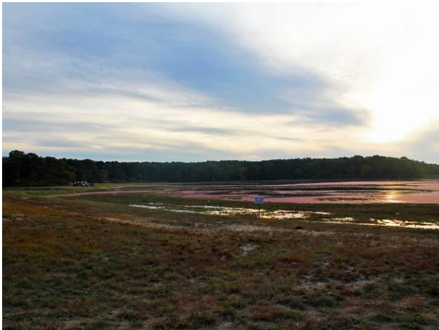
The CCRT passes by several active cranberry bogs, such as Jenkins Cranberry Bog, Harwich. (See Appendix G for photo information.)

The CCRT's narrowness means that the park intersects natural communities from adjacent properties. Community types through which the CCRT passes are identified in Table 9.2.5. A variety of cultural landscapes, such as cranberry bogs, power line corridors, and residential yards also abut the trail.