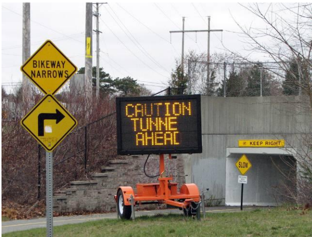
Safety issues at the Eastham underpass are currently being evaluated; efforts to increase cyclist awareness to improve safety have been implemented. (See Appendix G for photo information.)

Two bridges carry trail users over Route 6, and three underpasses carry them beneath high volume roads. One of these underpasses, at Route 6 in Eastham, requires riders to cycle downhill before making a turn into a tunnel. At least 17 accidents have occurred in this underpass since 2010 (Myers 2014). Stop lines, stop signs, and message boards were installed at both entrances in the fall of 2014 in an effort to increase safety by decreasing the speed of cyclists entering the tunnel. In addition the inside of the underpass was painted white and lighting was added to improve visibility.