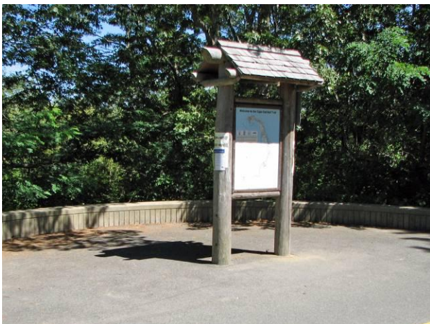
Log-framed kiosk at Wellfleet trailhead; this rustic design is used at paved parking lots along the CCRT. (See Appendix G for photo information.)

There are two types of kiosks; those associated with paved parking lots and those at other locations along the CCRT. Kiosks at paved parking lots are constructed of logs and have wood shingle roofs, creating a rustic appearance. This design is employed at both trailheads and the Route 137 lot in Brewster. Elsewhere on the CCRT kiosks are constructed of standard dimensional lumber and have fiberglass roofing shingles. These are located at the Harwich bike rotary, Nickerson state park trailhead, and the Route 6 overpass in Orleans adjacent to the court house. The Harwich Conservation Trust has a kiosk, similar in appearance to DCR standards, at the Depot Street parking lot in Harwich.