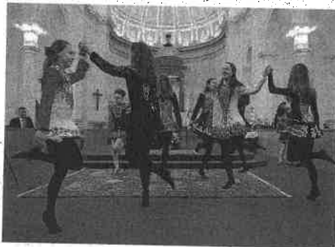
■ Students from the Dunleavy Boyle Bremer Academy of Irish Dance in Hanover perform during the annual St. Patrick's Day and Public Safety Mass on Saturday at St. Patrick Church in Brockton.

A new career could be waiting for you in the classifieds! Check it out Today!