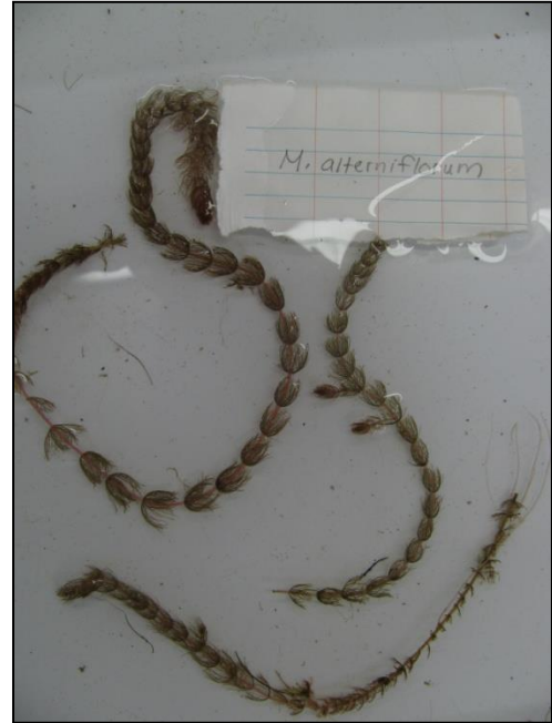
Slender Water-milfoil has feather-like leaves arranged in whorls of three to five along slender stems.

AIDS TO IDENTIFICATION: The identification of water-milfoils ( Myriophyllum spp.) is difficult and requires careful examination of foliage, flower arrangement, floral bracts, and fruits. Slender Water-milfoil is identified by its short (3–12 mm) leaves dissected into three to seven pairs of segments, short internodes (mostly < 1 cm), short spikes (2–5 cm tall), and an alternate arrangement of at least the uppermost floral bracts and flowers. The lowermost bracts and flowers may be opposite. The floral bracts have entire or minutely-toothed margins and are shorter or equal in length to the flowers. This species does not form winter buds (turions).