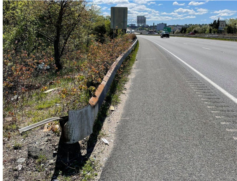
Existing conditions of deteriorated pavement, guardrail and overgrown vegetation