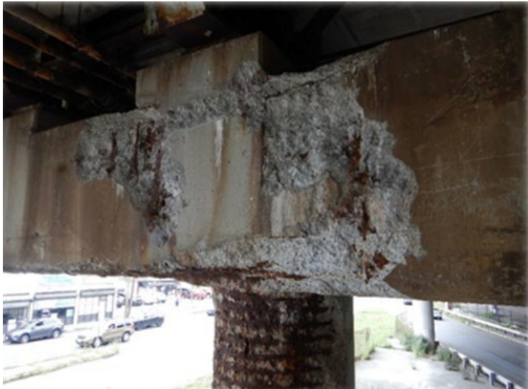
Typ. Deterioration of Concrete Piers