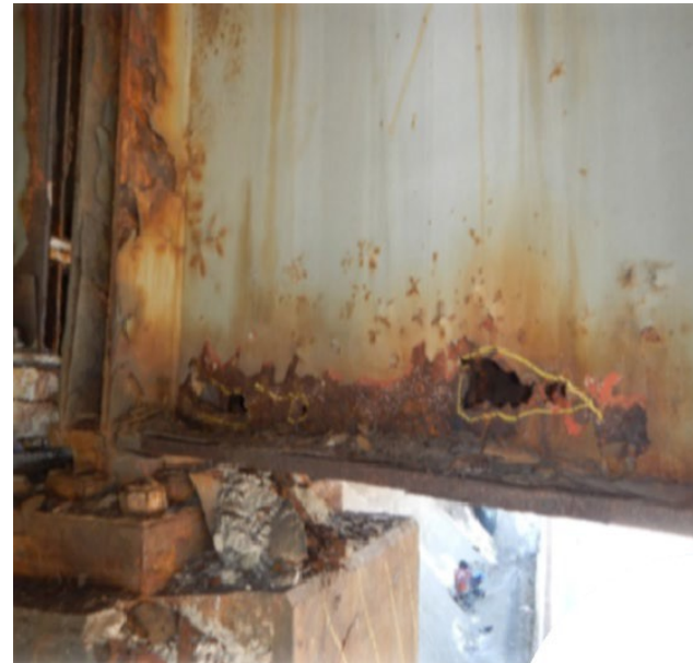
Typ. Deterioration of Steel Superstructure