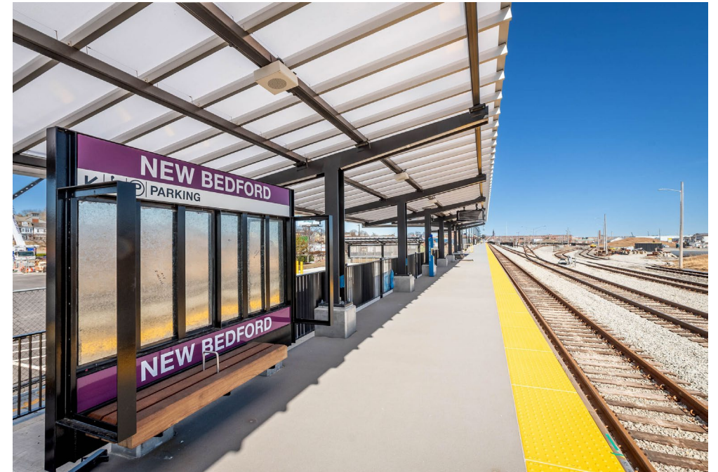
Commuter rail platform in New Bedford