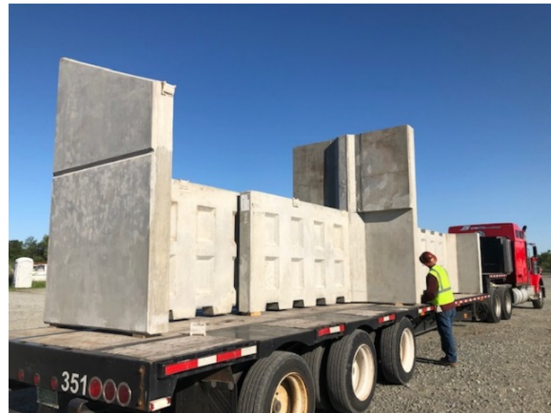
Precast Culvert Delivery