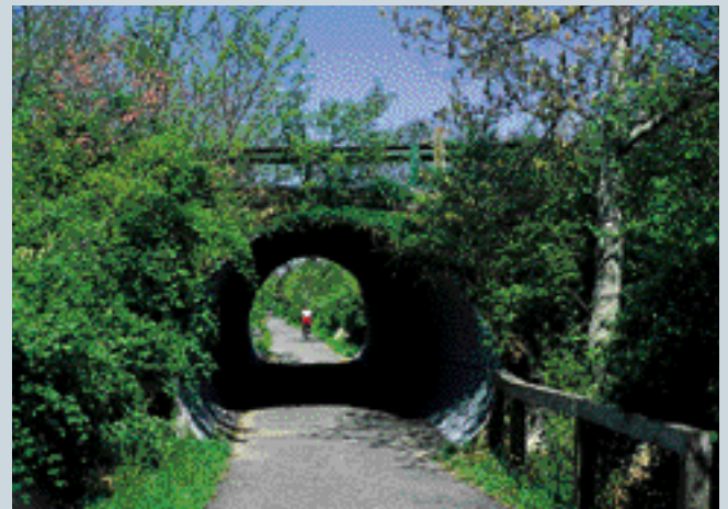
The Cape Cod Rail Trail.

network attracted significant public support. That support has continued to grow thanks to annual “Walking Weekends” sponsored by nonprofit organizations working with the Commission, municipalities, and the National Park Service. With 50 to 60 miles of dedicated trail on the ground, the Pathways network is within reach.