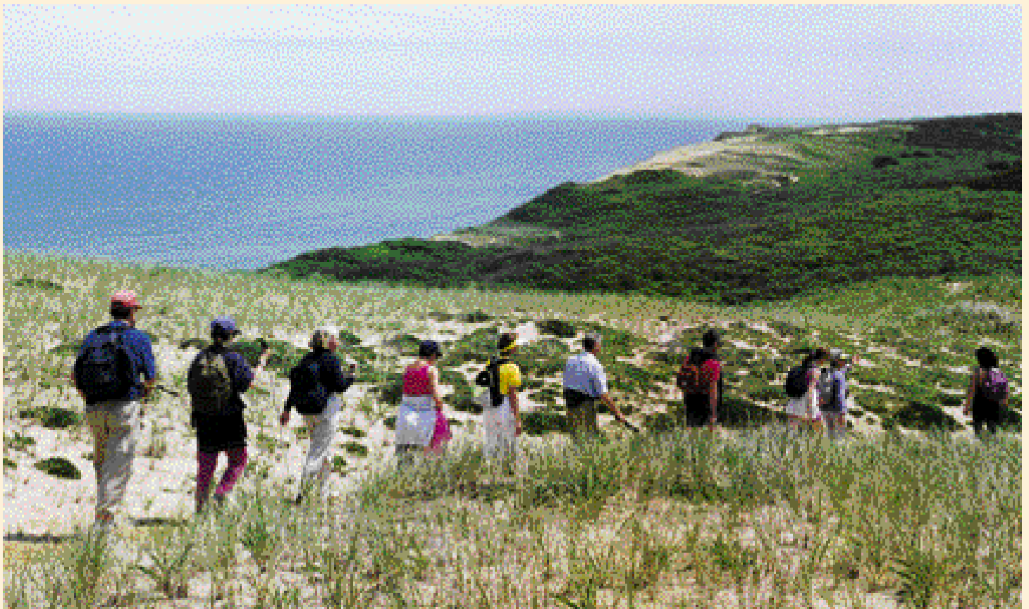
Hikers explore the Outer Cliffs during a Cape Cod Pathways “Walking Weekend.” (Kathy Sferra)