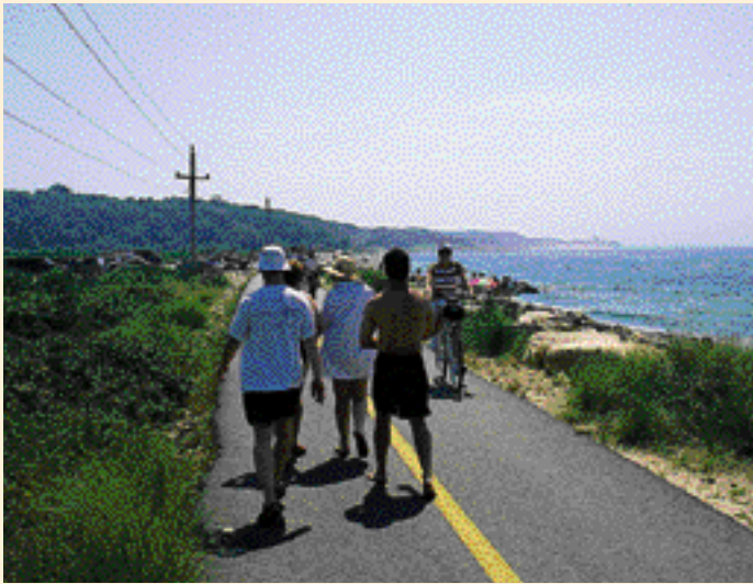
The Shining Sea Bikeway in Falmouth.