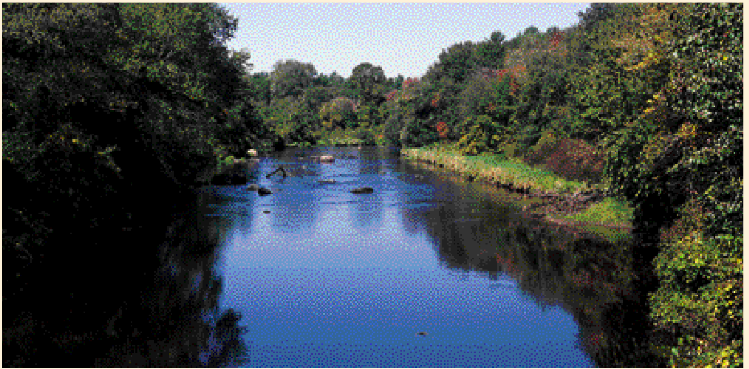
The Taunton River north of Route 44. Advocates are working to create a water trail and increase public awareness of this underappreciated natural treasure. (Kathy Sferra)

However, unplanned growth is fragmenting the very landscape which makes this region an appealing destination. Open land is being converted to residential and commercial uses, threatening the integrity of fragile natural systems and putting tourism and agriculture — two major land-based industries — at risk. Citizens are working hard to protect key natural features and to secure a meaningful greenway network within a developing landscape while it is still possible. Priority actions are outlined below: