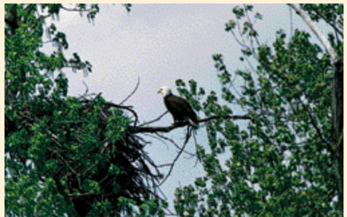
An American Bald Eagle. The Assawompset Pond Complex is one of the only year round nesting sites in Massachusetts for this endangered bird.

This region offers many other unique greenway opportunities. Efforts to open up portions of the 8,000-acre Assawompset Pond Complex for passive recreation would create a key link between the Taunton River and Buzzards Bay greenways. Advocates also envision connecting the Bay Circuit with Cape Cod Pathways through Myles Standish State Forest, linking over 300 miles of trails and over 15,000 acres of open space. On the same scale, a recent management plan for the reuse of 15,000 acres of the Massachusetts Military Reservation calls for large scale conservation, and considers the possibility of a trail network which could eventually link the reservation with Cape Cod Pathways and beyond. These large scale projects underscore the value of creating linkages and exemplify the synergistic effect creating greenway networks can have.