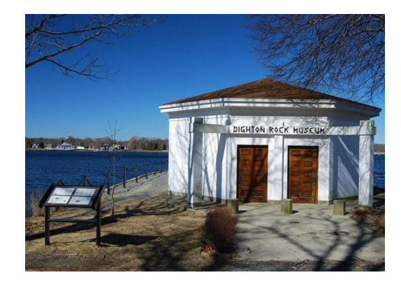
Home of the Official State Explorer Rock