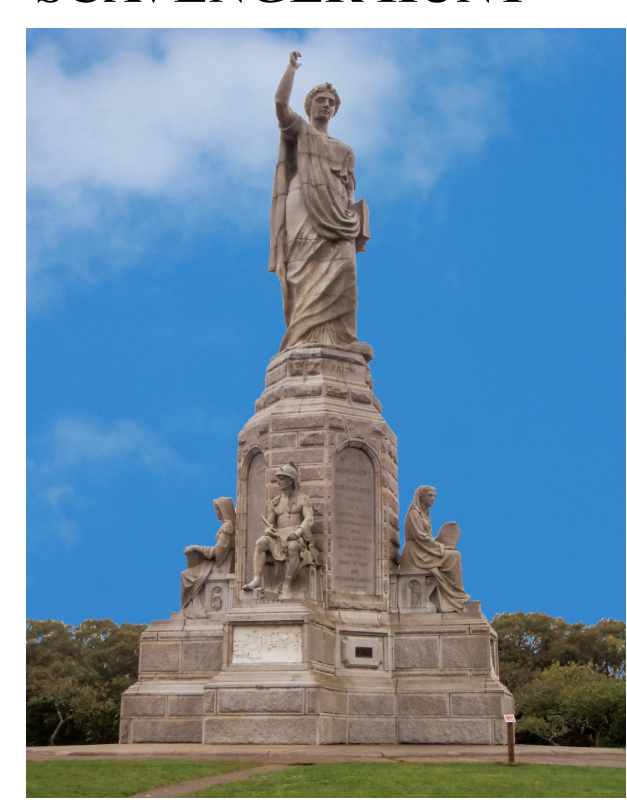
Depicts the virtues of Faith, Morality, Education, Law, and Liberty. It is thought to be the largest solid granite monument in the United States.