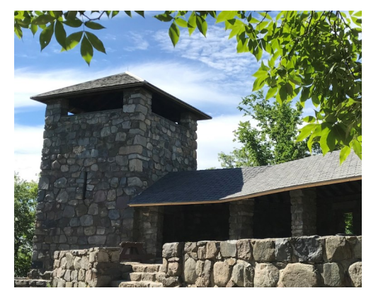
Tower atop Great Blue Hill boasts panoramic views and honors park founding father.