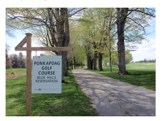
The nation's oldest public golf course