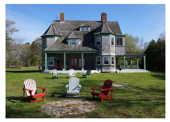
Sit atop a 30 foot bluff and enjoy views of Waquoit Bay from this Victorian era mansion