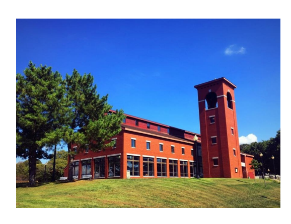
Discover this city's industrial history and rich culture highlighted at the Heritage State Park.