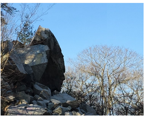
Unique glacial erratic, thought to resemble Wampanoag Sachem Massasoit.