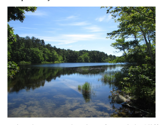
Enjoy the spectacular views from Little Cliff or Big Cliff ponds.